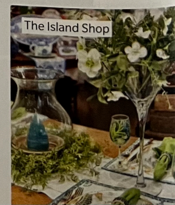
The Island Shop

Located in the old Cooperage Building at the Royal Naval Dockyard, this is the spot to discover local artisans. Browse hand-drawn illustrations, vintage maps, watercolour prints of idyllic island scenes and other souvenirs. 4 Maritime Ln., Sandys Parish, bermudacraftmarket.com