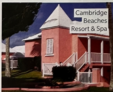
Cambridge Beaches Resort & Spa

Built in 1906 as a private residence, this premier historical property became a hotel in 1954. Thanks to a modern makeover last year, the interiors now blend mid-century and traditional island styles, nodding to Rosedon's roots. Exploring the beautiful grounds is a must — walk the lawns or lounge by the pool. The new restaurant, Clarabell's, serves wood-fired pizzas in a garden setting. 61 Pitts Bay Rd., Pembroke, rosedon.bm