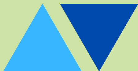
St. George's colours

At the game, fashions are coordinated around these colours from head to toe – from ties to shirts and shorts, to earrings to manicures, so pick a side!