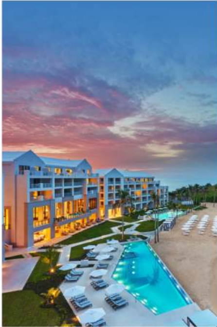
The St. Regis Bermuda Resort

One of Bermuda's newest hotels, The St. Regis Bermuda Resort opened in 2021 in the historic Town of St. George. The property offers indoor and outdoor meeting space along with two onsite restaurants and 120 rooms and suites boasting breathtaking ocean views.