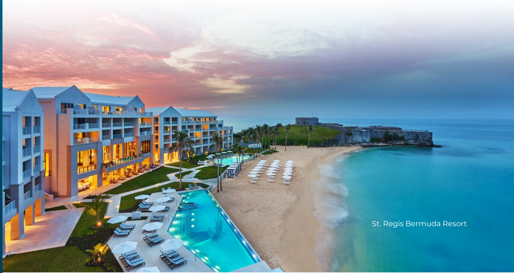
St. Regis Bermuda Resort

Cambridge Beaches Resort and Spa is Bermuda's first cottage-style resort. The expansive property is situated on a private peninsula surrounded the ocean and bay waters. Architectural details date back to 1663, however the resort offers luxury experiences that today's traveller would expect. There are four private beaches, two private coves, a spa, beach side restaurant, and infinity-edged pool. Guests can arrive by land or to enjoy this enchanting property.