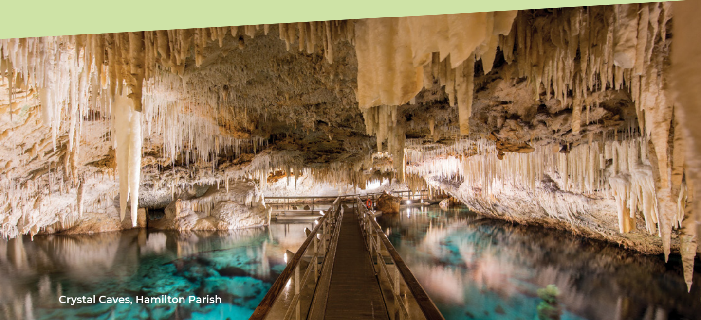
Crystal Caves, Hamilton Parish