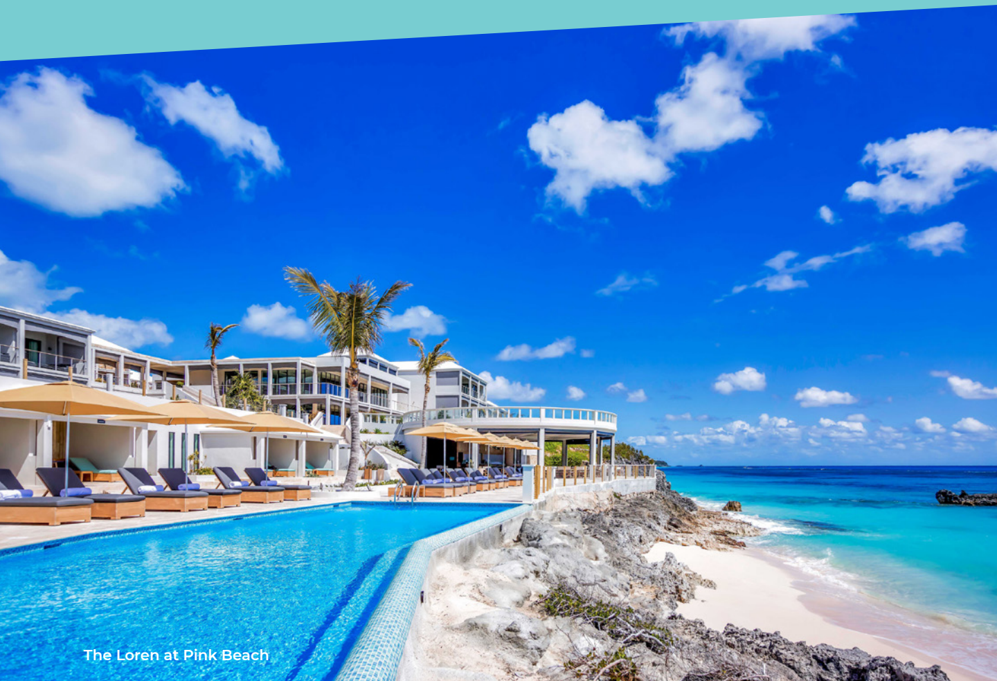
The Loren at Pink Beach