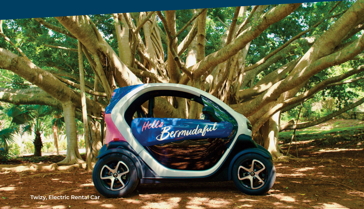
Twizy, Electric Rental Car