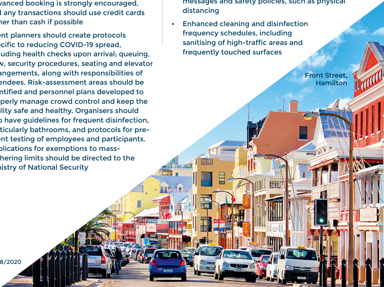
Front Street, Hamilton