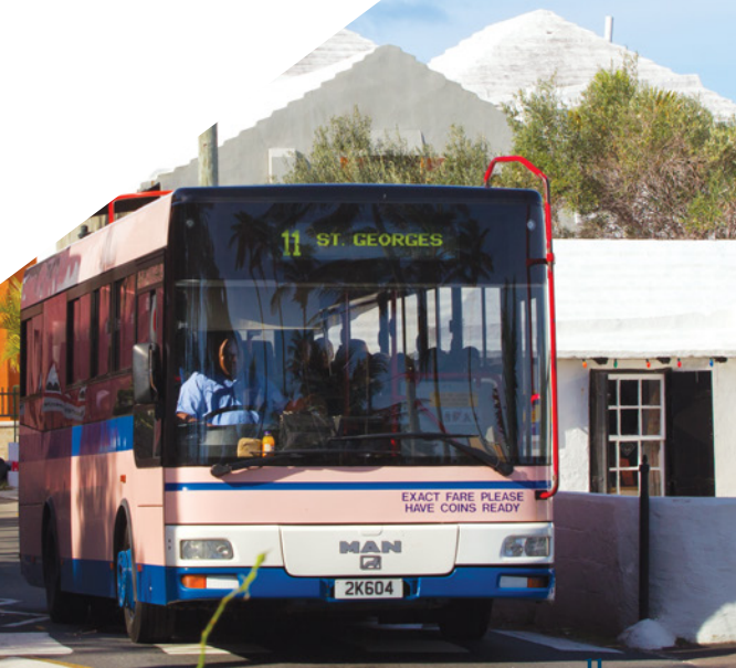
Bus in Flatt's Village