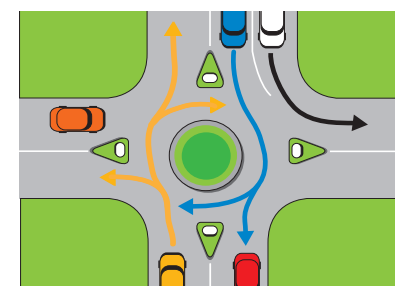
ROUNDABOUTS Traffic procedure: give way to traffic on immediate right.